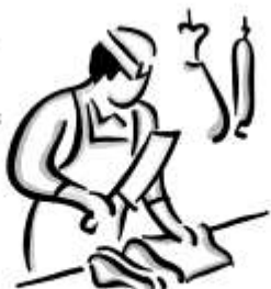
Quality Family Butcher