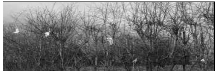
Dog poo bags litter the hedgerow at Lane End