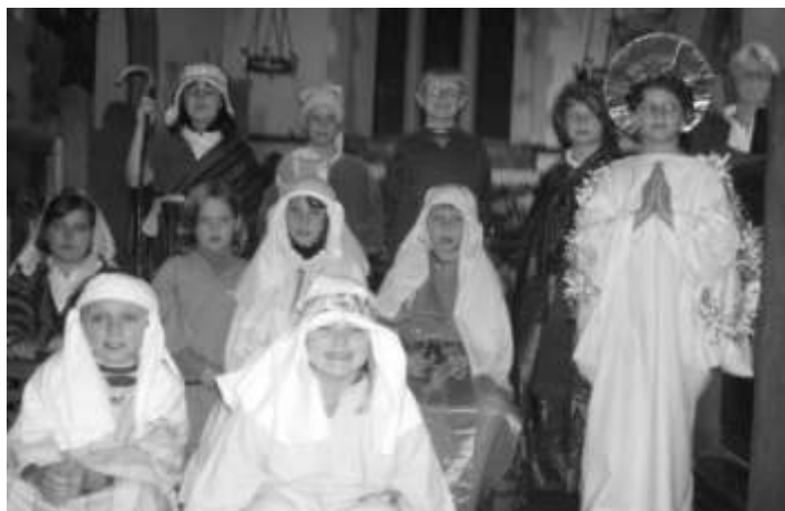
Year 4 pupils at the school Nativity performance

A happy New Year to all from Milborne St Andrew First School. The end of last term was a very busy time in school with many Christmas activities being enjoyed by all. Christmas assemblies were given by each class and the year 4 children told the Christmas story during the nativity performance at St Andrews church. In the last week of term all pupils, staff and governors were treated to a Christmas lunch, with all the trimmings, funded, cooked and served by Friends of School. It's quite a mammoth task to serve over 100 meals from such a small kitchen and many thanks go to all those involved. The afternoon visit of Father Christmas was as ever thoroughly enjoyed by the children.