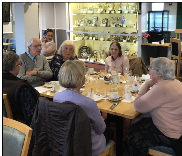
WI Annual Dinner at Ashley Wood Golf Club on 11th May